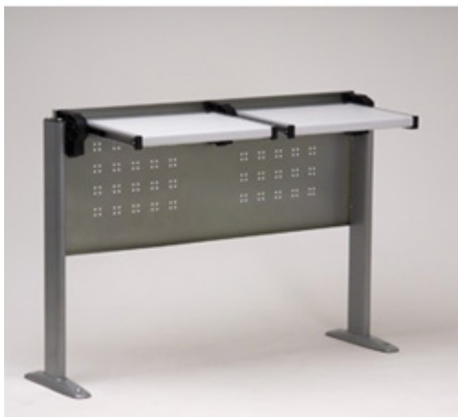
Table of 2-3 seats for the press/journalists' area. Structure in steel tube – 90x30x2 mm. oval section; floor-fixed base in sheet steel 3 mm. thick. Supporting beam in steel tube – 60x40x2 mm. rectangular section. Folding device in reinforced technopolymer in black colour.

Support to the folding top of the table in extruded aluminium and side rail in steel.