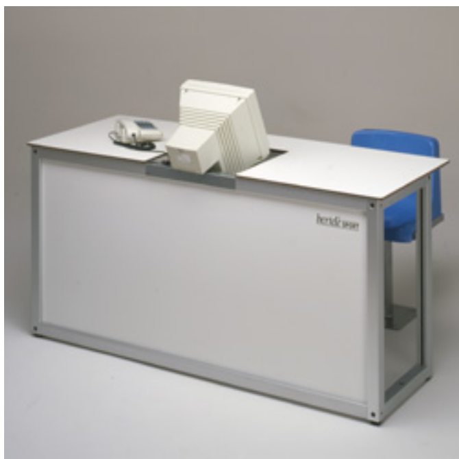
Table of 2 seats for the press/journalists' area. Structure in 45x45 mm. special profile in anodised aluminium with internal ribs.

Fixed top of the table in laminated multi-layer wood 10 mm. thick. The top of the table can be shaped and worked on request. Front panels in laminated multi layer wood 4 mm. thick.